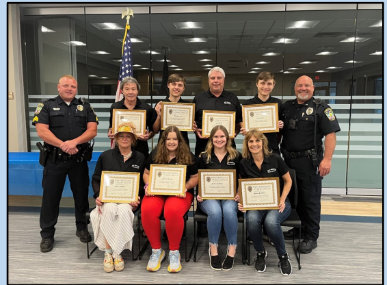
Citizens Police Academy 2023 Graduating Class

On May 25 th , 2023, West Hennepin Public Safety Department (WHPS) had their 21 st annual Citizen's Academy Graduation Ceremony. Citizen's Academy teaches residents the basic day-to-day functions of WHPS. The graduates attended presentations from numerous officers, Drug Task Force Agent, General Investigator, City Attorney, Hennepin County Judge, and more. They also participated in mock traffic stops, DWI enforcement, and a police K-9 presentation. The participants took field trips to Hennepin County Dispatch for a tour and went to South Metro Public Safety Training Facility to use the firearms training simulator.